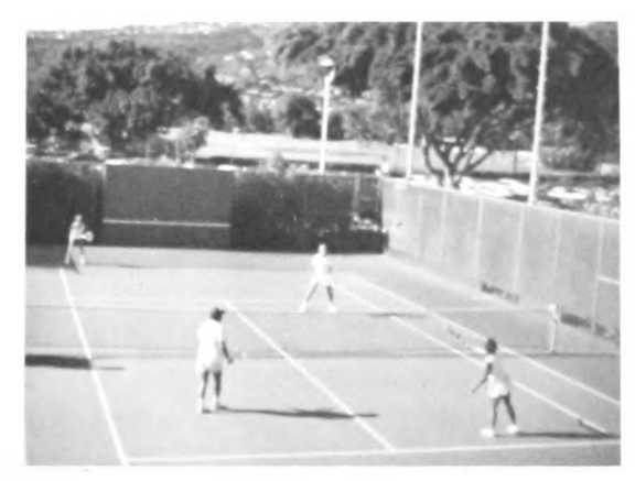
Mixed doubles action

ested in tennis activities. (Over 100 are now listed on our OCC game roster.) By the time you read this, a revised roster will have been mailed. If you have somehow missed the rostersign up on the athletic board next to the Beach Shop, or call Phil Whitney at 422-7644. For other activities, watch the activities board.