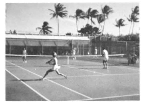
More of the same

ested in tennis activities. (Over 100 are now listed on our OCC game roster.) By the time you read this, a revised roster will have been mailed. If you have somehow missed the rostersign up on the athletic board next to the Beach Shop, or call Phil Whitney at 422-7644. For other activities, watch the activities board.