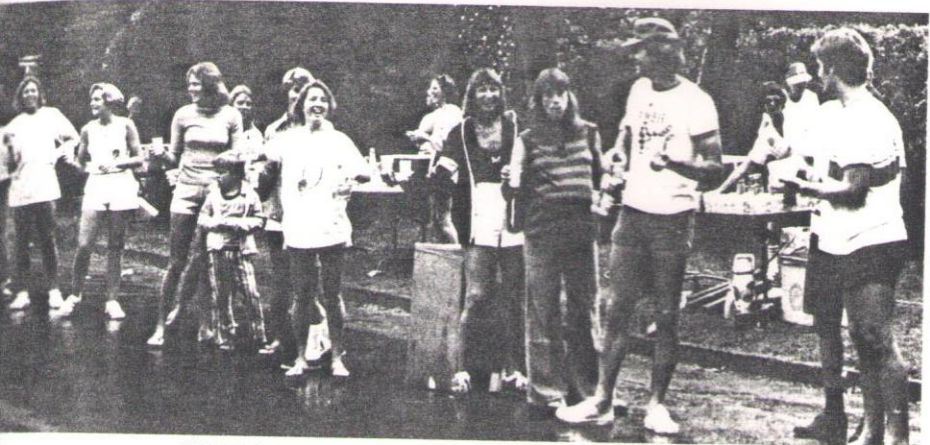
OCC Aid Station volunteers cheer on the runners.