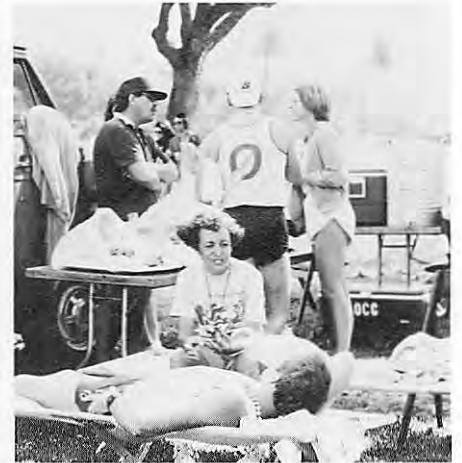
The tent that wasn't! OCC finishers got a rubdown and food and drink at the OCC tent area. Due to high winds the tent came down.