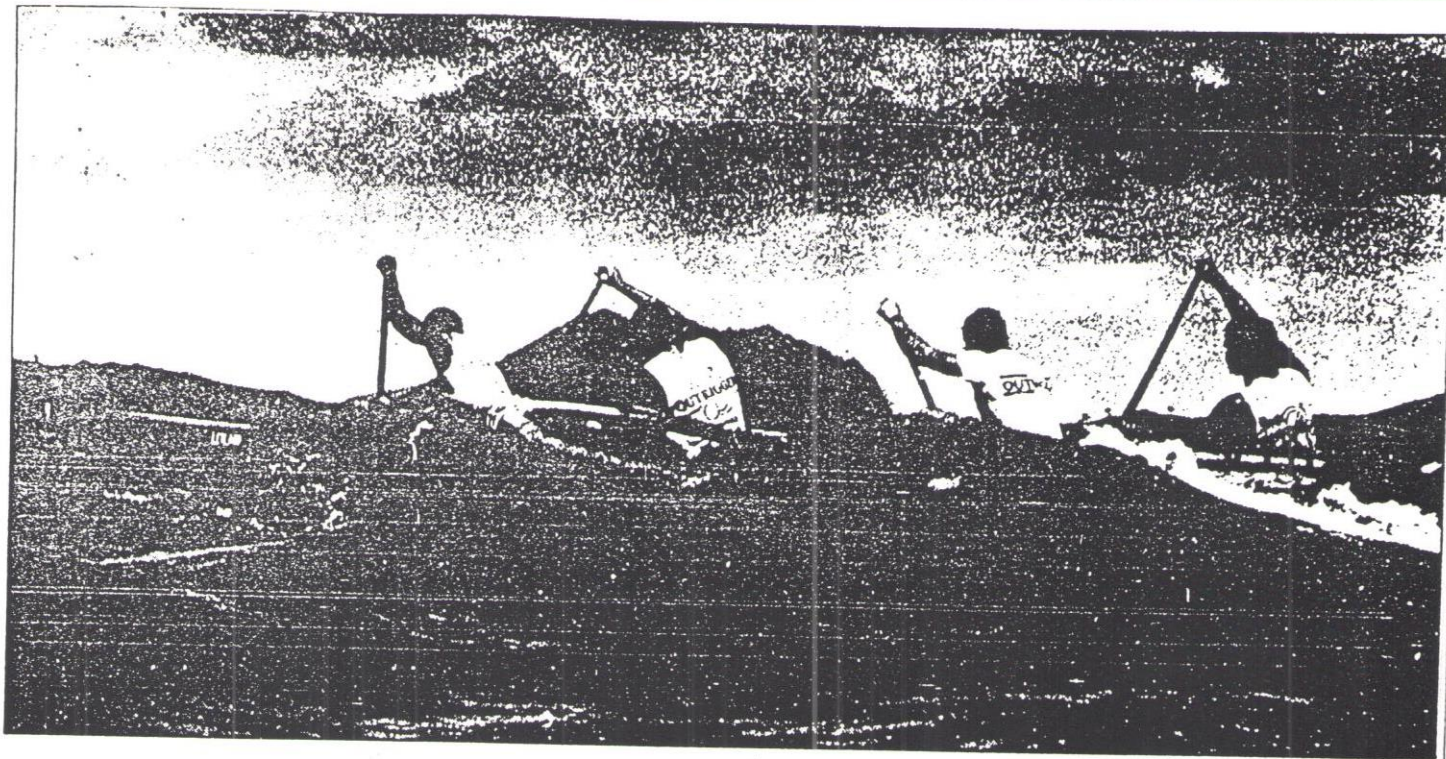
Outrigger Canoe Club's No. 1 crew has a swell time in Kaiwi Channel.