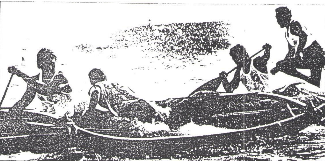
A textbook crew change: one man jumps in (middle) while another jumps out (right).