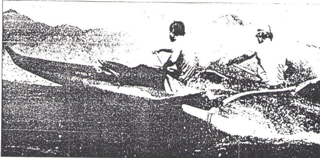
Bow up, the Illinois Brigade surges through the chop.