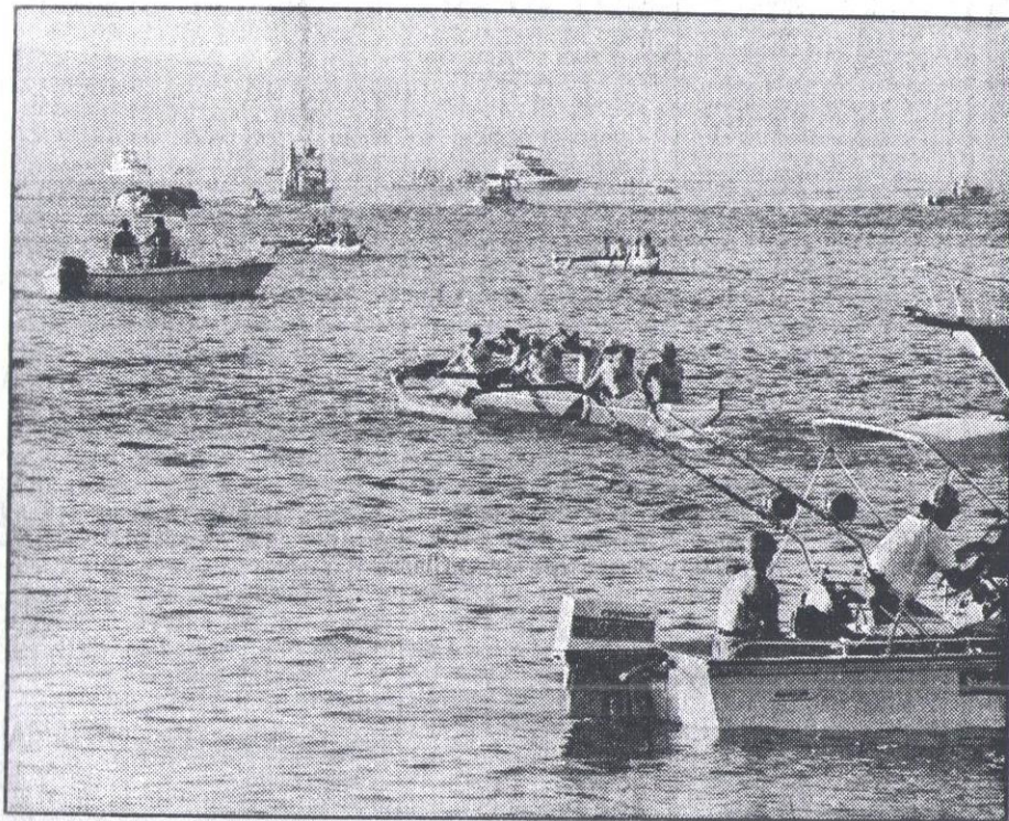
Canoes and their escort craft sort themselves out . . .