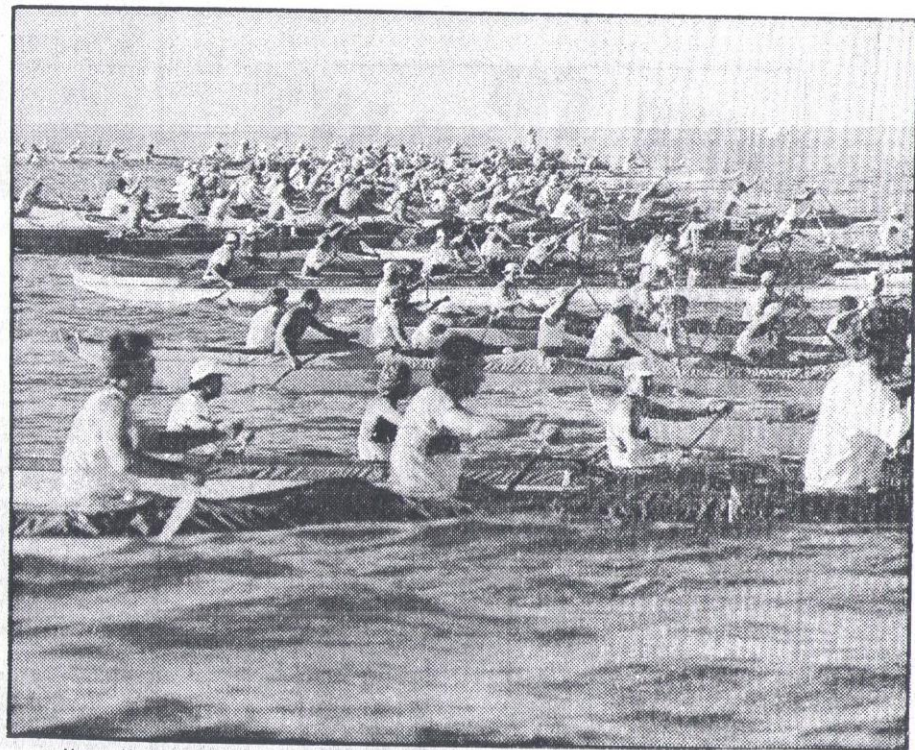
. . . then the canoes line up for the start.