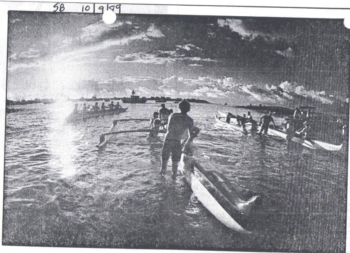
Canoes launch at dawn after a Hawaiian blessing at Molokai's Hale O Lono Harbor.