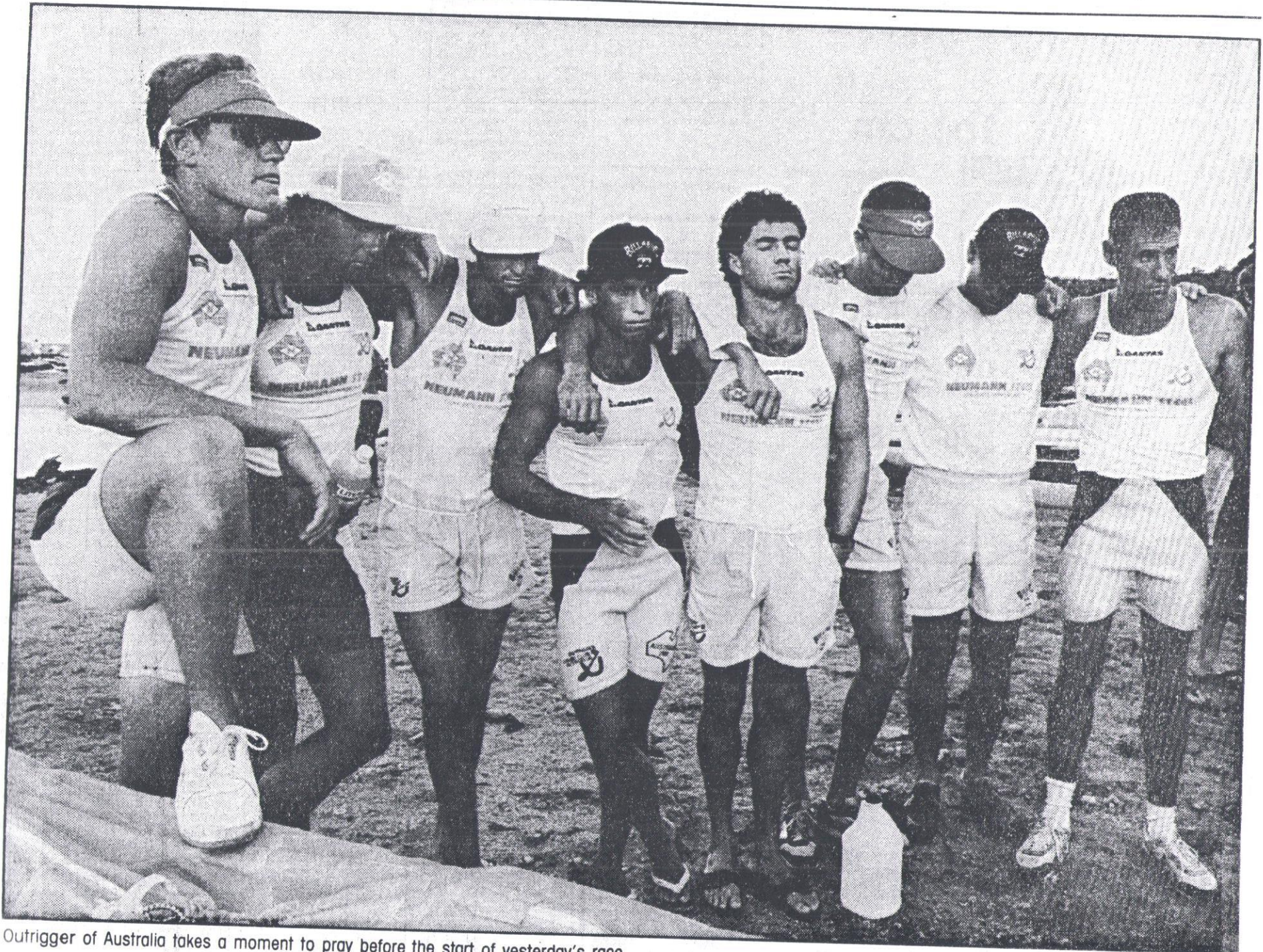
Outrigger of Australia takes a moment to pray before the start of yesterday's race.