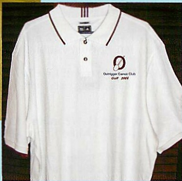
OCC Golf Shirt