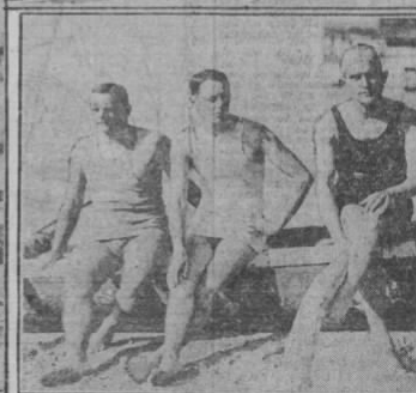
Here are the swimmers who took part in the Thanksgiving Day surf swims of the Outrigger Canoe Club.