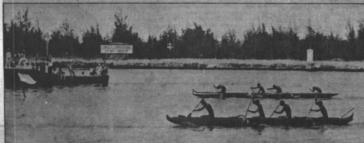
PALPITATING FINISHES —(1) Hui Nalu and the Beach Patrol end all even in the Junior four, a dead heat and one of the most thrilling moments of the regatta. (2) Hui Nalu wins again, but oh, so close! The finish of the senior two event, almost bow for bow between Hui Nalu and the Outrigger Canoe Club. (3)