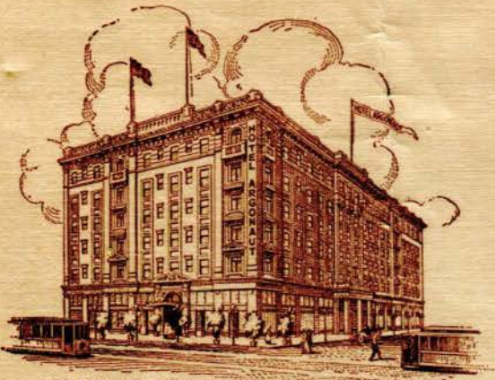
SOCIETY OF CALIFORNIA PIONEERS BUILDING

HOTEL ARGONAUT FOURTH AND MARKET SAN FRANCISCO, CALIFORNIA