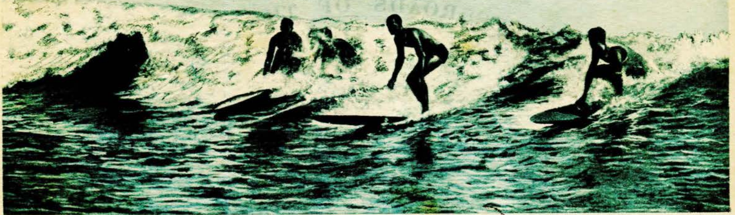
ON THE BEACH AT WAIKIKI