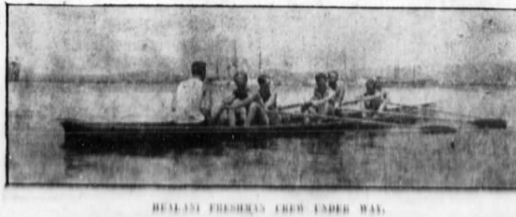
HEALANI FRESHMAN'S FOUR OARED BARGE.