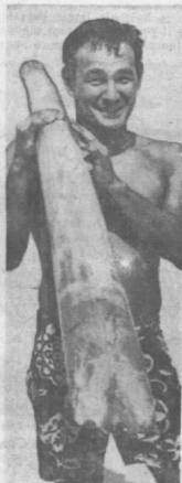
Advertiser Photo by Gordon Morse

The groups hope to make the breakfast an annual affair.